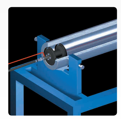
Detector with adapters in the tube.