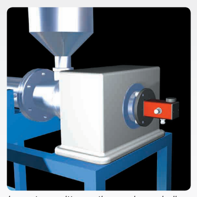
Laser transmitter on the gearbox spindle.